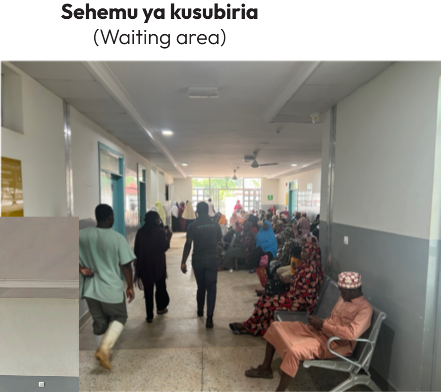
Sehemu ya kusubiria (Waiting area)