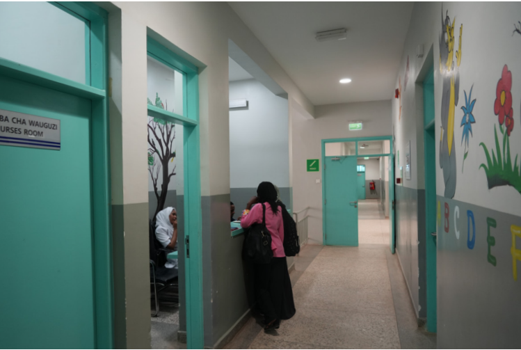
Sehemu ya wauguzi (Nurse station)