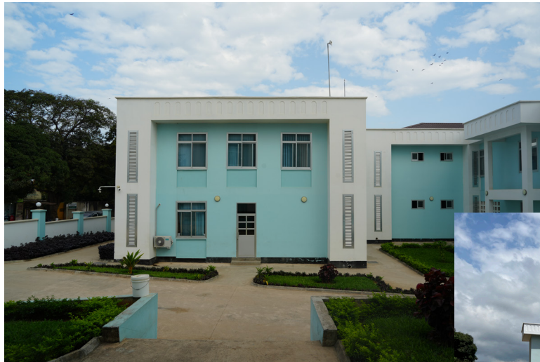
Mazigira ya nje outdoor areas

Where do people get bitten by mosquitoes in the hospitals